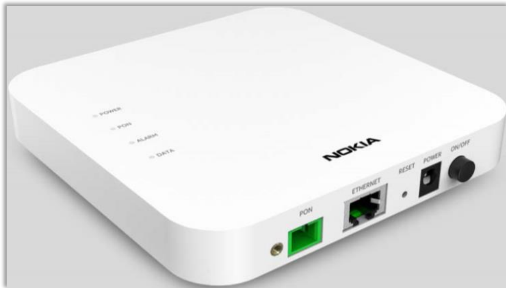
Figure 3: NBI Optical Network Terminal (Nokia XS-010X-Q)

The technical specification for the Nokia XS-010X-Q ONT can be found in the appendix.